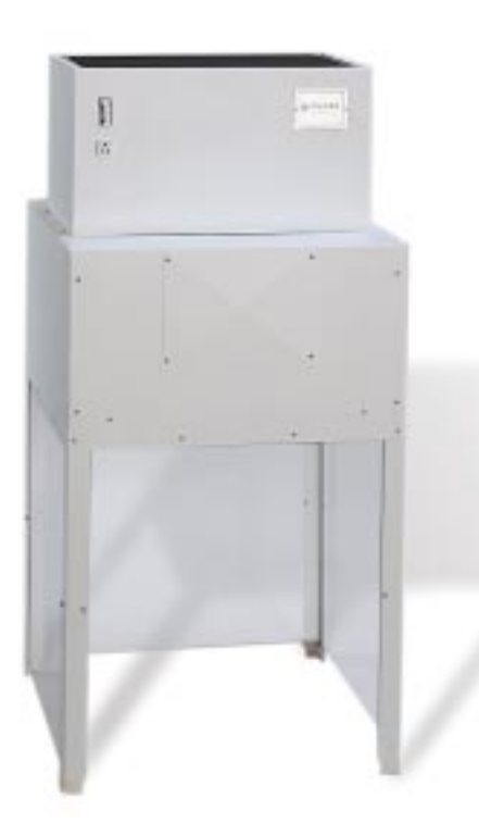
Vertical Flow Unit

†Note: Positive pressure laminar flow clean benches provide product protection only. Reverse or negative pressure laminar flow cabinets provide limited personnel and environmental protection from aerosols generated within the work area.